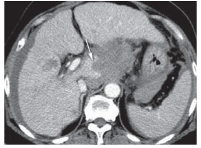
Figure 4. Focal bulging of the caudate lobe with a parenchymal defect on the medial aspect was a ruptured hepatoma (arrow).

in exophytic hematoma into the peritoneum. Only eight previous cases were found in the literature. (1-4) Four cases were treated with vascular embolization, (1,3) one case was treated with immediate surgery after vascular embolization failed, (4) one case was sent to surgery after abdominal CT confirmed the diagnosis, (2) one case was in hypovolemic shock and died 1 day later without any treatment, (3) and one case received supportive care and survived for another 104 days. (3) Our case may be the second only case treated with supportive care and discharged without complications.