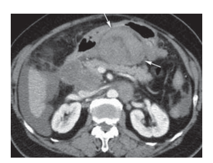
Figure 2. Coronal reformatted CT image showing an exophytic hematoma below the liver, left and lateral to the duodenum.

She stayed in our hospital for 7 days and was discharged after transarterial embolization of the residual hepatoma. Follow- up 30 days and 90 days later revealed no complications.